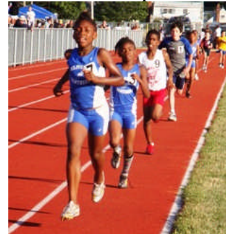
Tough race for youth athletes