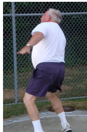
Masters Shot Put