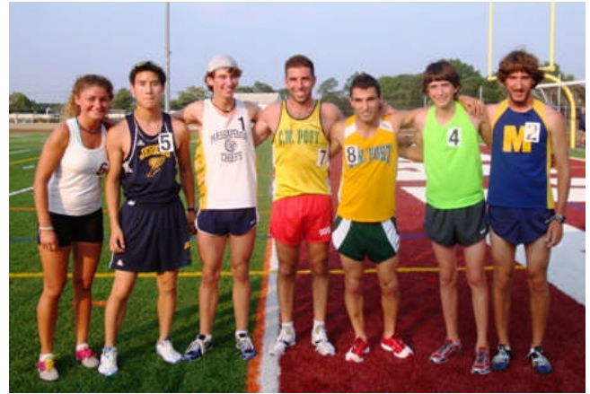
Getting ready for the 2000 m run at Walt Whitman HS