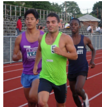
Action at Mepham