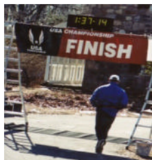
En route to a spectacular finish at Caumsett